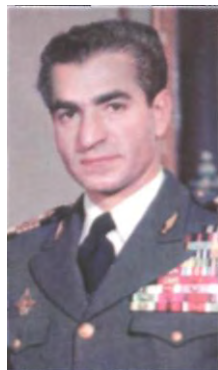
Above, the dreaded Mohammad Reza Shah Pahlavi, whose U.S.-backed secret police, SAVAK, terrorized the Iranian people for decades. The U.S. and Britain tried twice to oust Mohammad Mossadeq, succeeding in the second of two coup attempts in 1953. The CIA in Iran is taken from the once-secret follow-up report written by CIA operative Donald Wilber, whose involvement with the overthrow of Dr. Mossadeq was integral to its success.